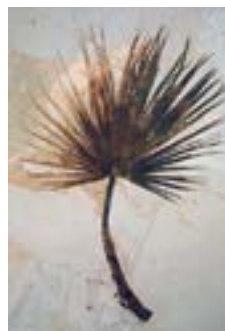
Palm leaf fossil