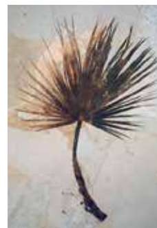
Palm leaf fossil