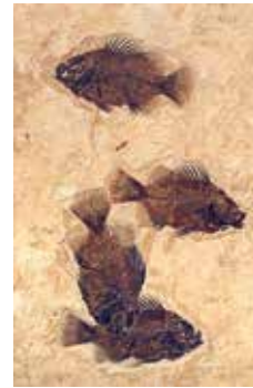
Four fish fossils